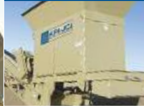
SERIES 12 FEED CONVEYOR