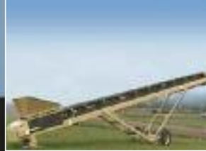
STRAIGHT CHANNEL FRAME