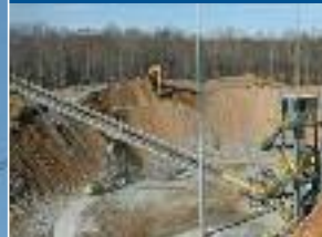
FIXED HEIGHT STACKER