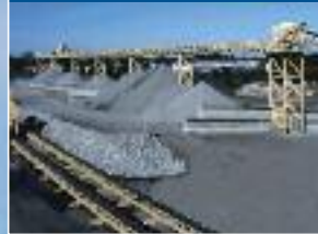
ELEVATED TRIPPER SYSTEM