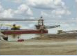
BARGE UNLOADING SYSTEM